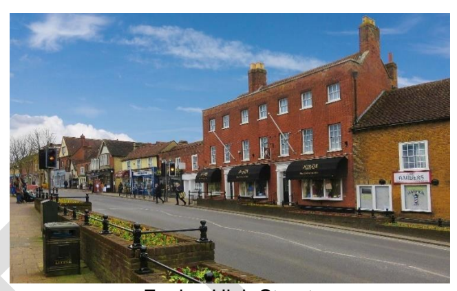
Loughton High Road